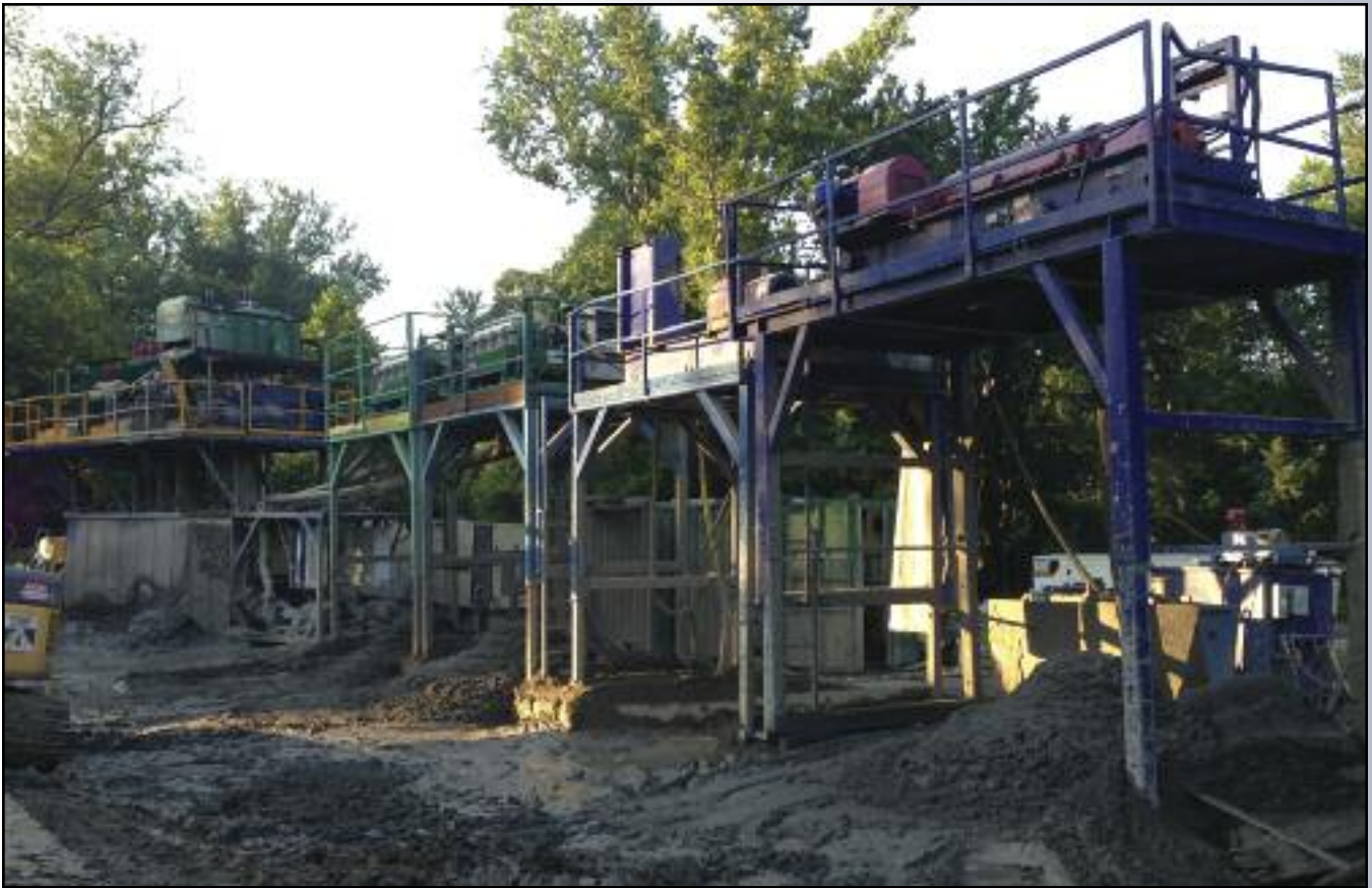
The ground needs to be excavated, transported, and separated for the slurry-based microtunneling system to work.

After completion of the microtunneling, Bradshaw restrained the casing against floatation beneath the Harrods Creek crossings by installing a concrete cradle to counterbalance the flotation pressure, as well as welding many of the Permalok joints.