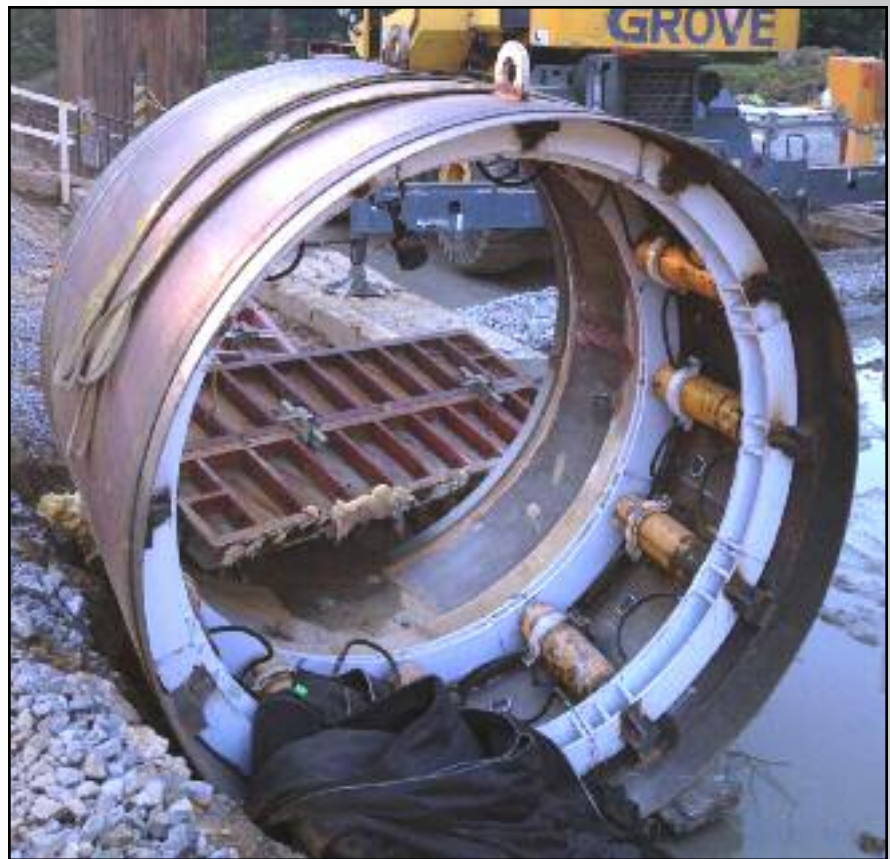
Bradshaw provided intermediate jacking stations and a high-volume bentonite lubrication pump.

larger-diameter trenchless installation in lieu of the six designed. This would allow both sewer lines to be installed within a single jacked steel casing. To accomplish this, the casing diameter was